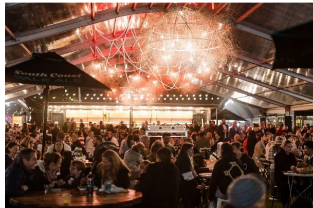
Events and Festival Sponsorship Programs

The West and East End were the key beneficiaries, with the highest changes on last year and the 12-month average. Night-time activity was also higher than last year.