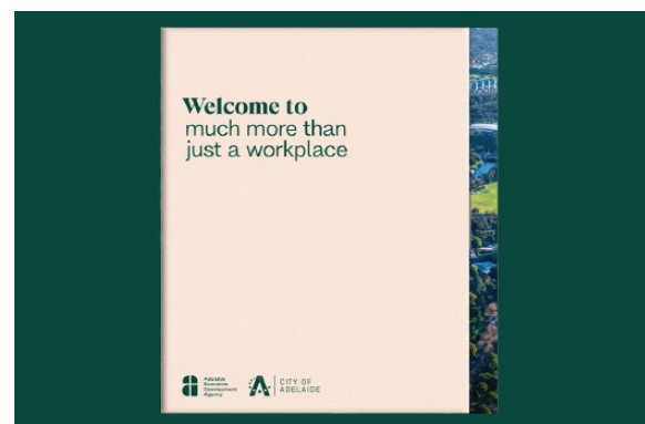
Welcome to Adelaide

The Commercial Events and Festivals Sponsorship Program provided $20,000 funding to support Home Base: Footy Place in quarter four which coincided with Gather Round. As this is a new event there is no historical data on estimated attendance and economic impact and the acquittal report is pending.