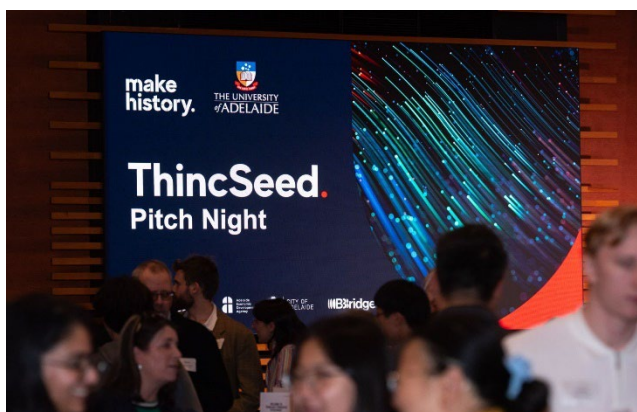
Strategic Partnership Program

MTPConnect's Global Navigator Program has assigned mentors to participating companies and begun workshops to help define market entry strategies for the companies.